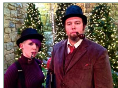
Victorian Christmas service on December 18, 2011