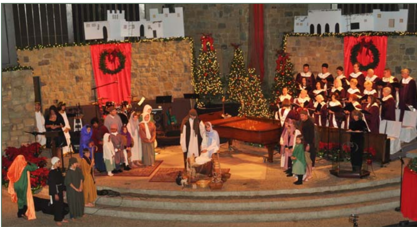
The Word of Promise Christmas Pageant