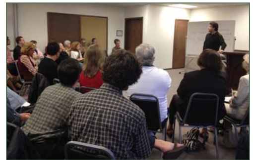
J to A Sunday School