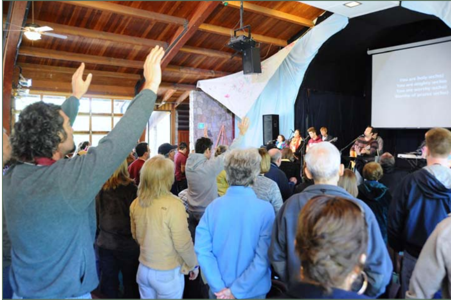
All Church Camp