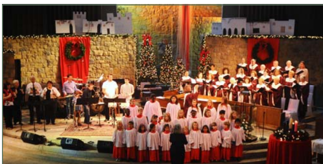
"The Word of Promise " A Christmas Pageant